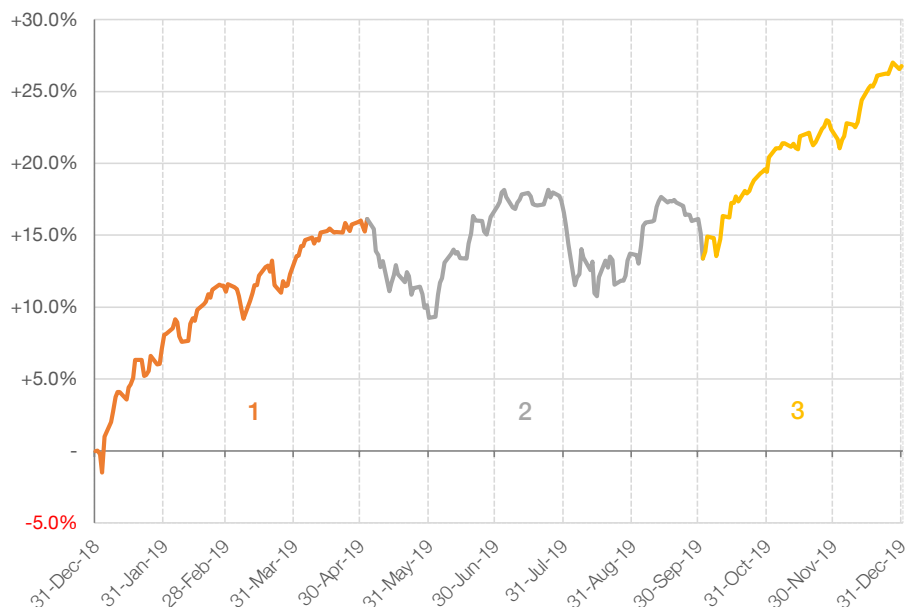
S&P Global Broad Market Index (BMI) cumulative return in 2019

* This is a float-adjusted market capitalisation global share index measuring the US dollar performance of 11,303 constituent companies across 48 developed and emerging market countries.